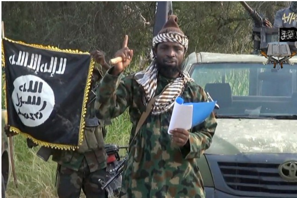
Le chef de Boko Haram, Abubakar Shekau

Le serment d'allégeance de Boko Haram à l'État Islamique est un signe de faiblesse du groupe islamiste nigérian, qui «est en train d'être éliminé» par l'armée nigériane et les troupes des pays voisins, a affirmé Abuja mardi.