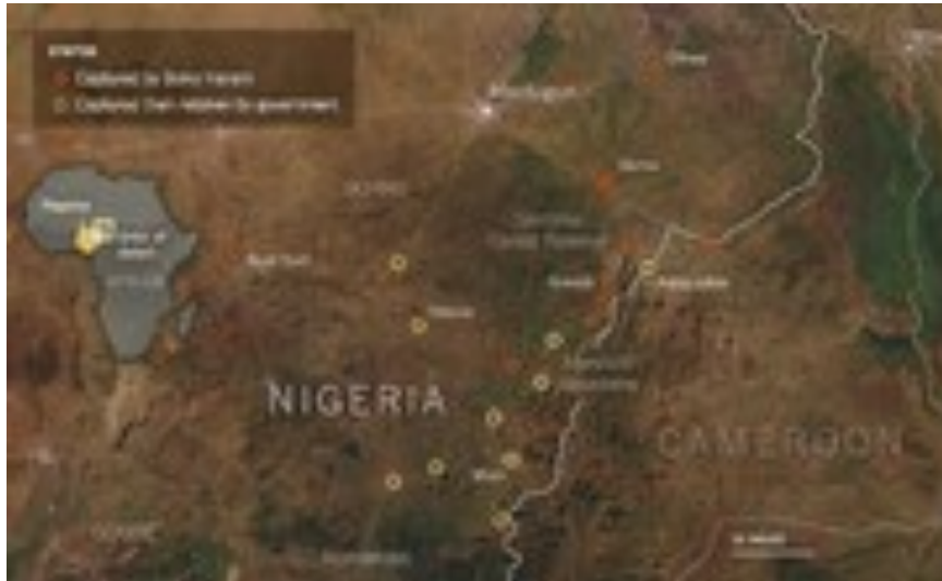
Graphic: Boko Haram: The Other Islamic State

“Regional cooperation so far has been weak,” according to an internal European Union assessment obtained by Wikilao , a Rome-based security website, adding that future cooperation may be hindered by the countries’ “little tradition of working together and sharing a long history of local disputes, different languages.”