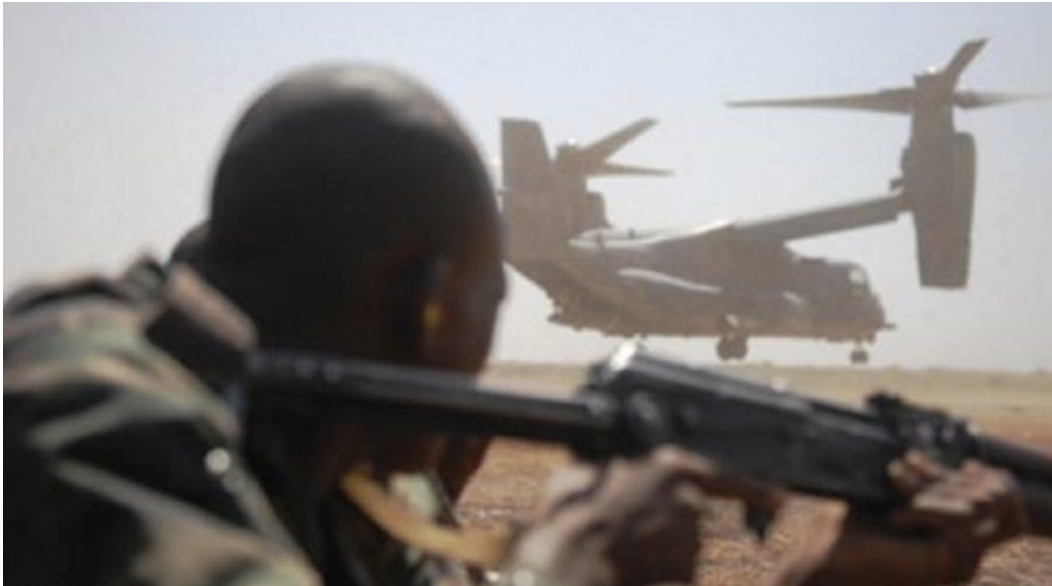
Malian soldier establishes security in a landing site during the multi-national exercise Flintlock.

Africa is currently facing two entirely distinct security threats, one from the rise of radical Islam, the other from increased natural resource extraction. African security forces are ill-equipped to meet these threats. Much of this is deep-rooted, rather than due to deficiencies that could readily be addressed. I first set out each of the new security threats. I then turn to Africa's military capacity, tracing its limitations to underlying motivations. I suggest that the most straightforward way of changing the belief systems that generate motivation is strengthening national identity, but that this has been made more difficult by the divisive force of electoral competition. I conclude that Africa will need three forms of international support.