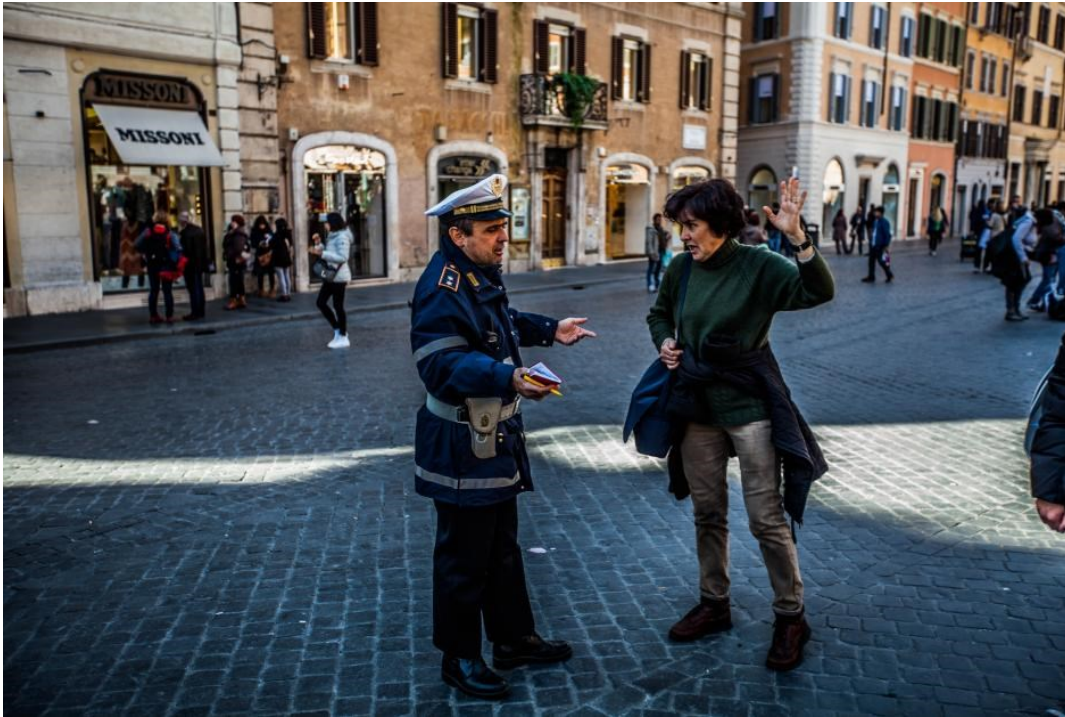
An officer with the Italian Vigili police force offers directions to a tourist near the Spanish Steps in Rome.

Yet most Italians don't seem particularly concerned about ISIS. In response to last week's "Pizza" threat on Twitter, some took to social media and mocked the terrorists with the hashtag "We_are_Coming_O_Rome," a reference to another typo'd tweet from the ISIS account. The popular hashtag served up funny travel tips, like this one: "Don't fall for the 'jump the line!' offers at the Vatican; it's a scam. Just wait your turn like everyone else." In a recent national poll by the European Observatory on Security, only 1.3 percent of Italians listed "terrorism" as their greatest concern, behind unemployment, corruption, the economy and taxes. Only "environmental degradation" scored lower.