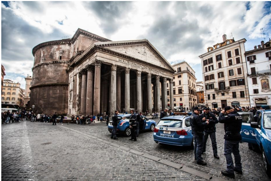
Officers stand guard outside the Pantheon in Rome.

Over the past few months, Italian authorities have rushed to prepare in case the threats are real. Shortly after the Charlie Hebdo attacks in Paris, Italy and Albania established a joint terrorism task force to train police officers and establish an anti-terrorism database. Italian security chiefs also installed 500 soldiers at sites around the country, with plans to add up to 4,800 more. And two weeks ago, Italy's cabinet proposed new penalties aimed at terrorists . Among them: prison sentences of up to six years for those convicted of recruiting jihadists and the ability to revoke passports of suspected militants.